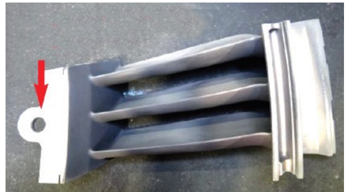
Figure 1: Example of Bolt Hole Repair

Turbine Overhaul Services Pte Ltd No. 5 Tuas Drive 2 Singapore 638639